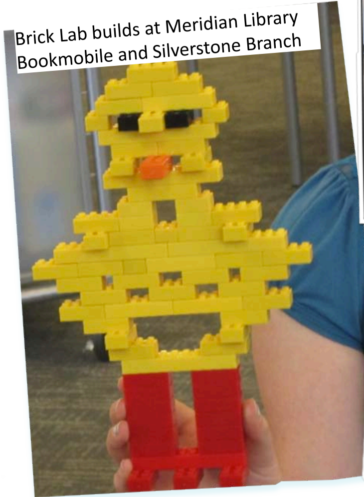
Brick Lab builds at Meridian Library Bookmobile and Silverstone Branch