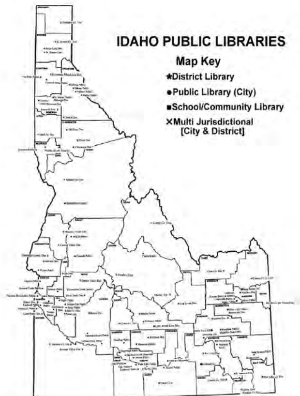
Idaho Public Library Statistics - FY09

For more information about online @ your library, visit http://libraries.idaho.gov/online .