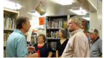
The Commissioners hear about Teen Read Week at the Cascade Public Library. For more photos of the Board tour, visit www.flickr.com/photos/38963497@N03/ .

Other featured pavilions at the festival were dedicated to genres ranging from history to mysteries, as well as books for families and young people. And, favorite authors were on hand for book signing. The National Book Festival is sponsored by the Library of Congress and the Festival’s Pavilion of the States is sponsored by the Institute of Museum and Library Services. Commission staff attends the festival through a grant from COSLA (Chief Officers of State Library Agencies). See more at www.loc.gov/bookfest .