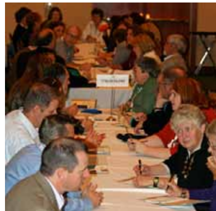
Speed-dating at the launch. See more photos at www.flickr.com/photos/38963497@N03/