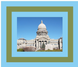
Idaho State Capitol Boise, Idaho

Whether through books, computing, Internet access, and as places for hands-on learning, libraries have always helped people explore ideas. Libraries continually evolve to not only meet, but exceed, the needs of their communities.