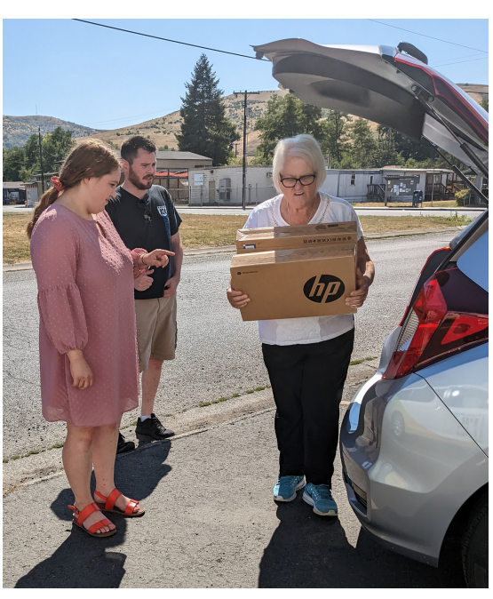
Prairie River Library District