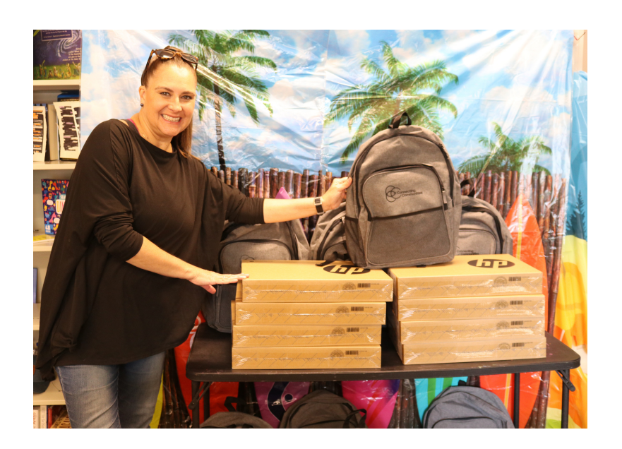
Bellevue Public Library

Through its Connecting Communities Digital Inclusion program, the ICfL provided 135 Chromebooks to public libraries throughout Idaho for the purpose of expanding digital inclusion, equity, and literacy efforts.