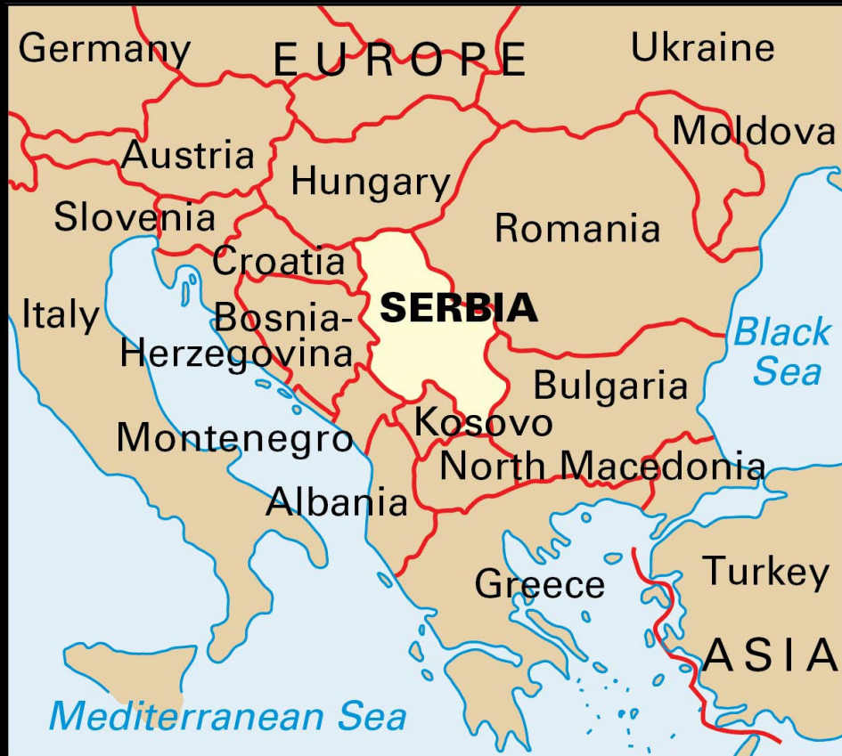
Serbia [Online media]. (2023). In Discover by World Book . https://www.worldbookonline-com.lili.idm.oclc.org/discover/#/media/lr005609/type/map-artl