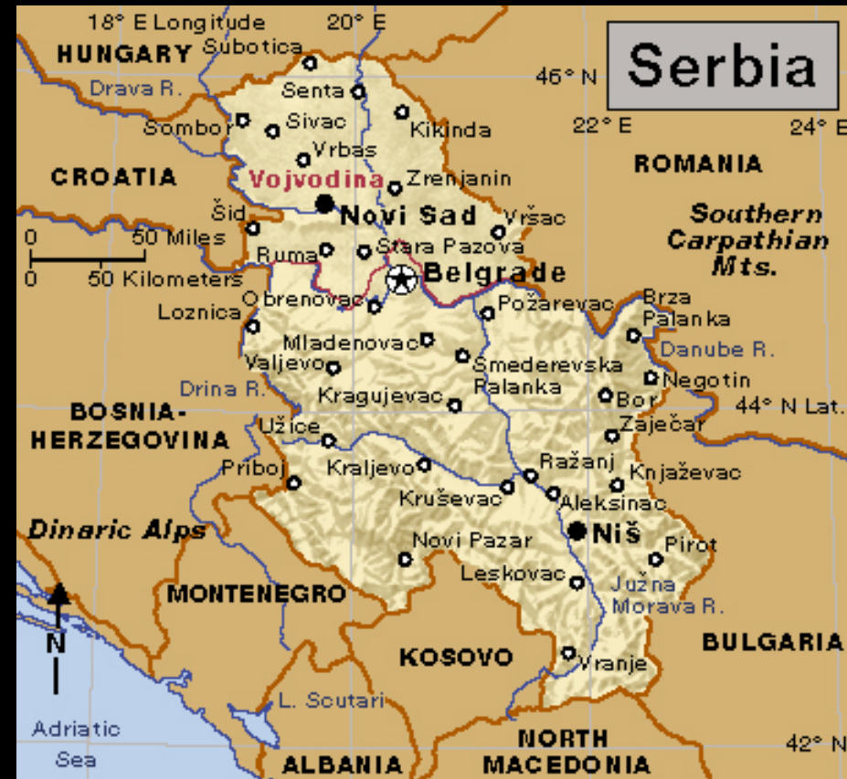
Serbia [Online map]. (2023). In World Book Advanced . https://www.worldbookonline-com.lili.idm.oclc.org/advanced/media?id=mp000261