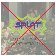
On top of photo