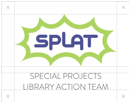
Logo mark with logo type