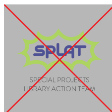
Lack of contrast