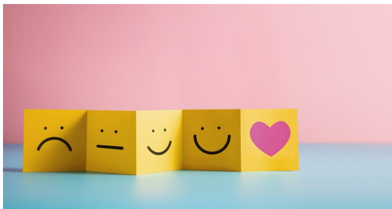
photo: frowning face to smiley faces